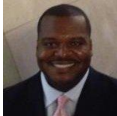
Executive Protection Bert Williams, Fannie Mae