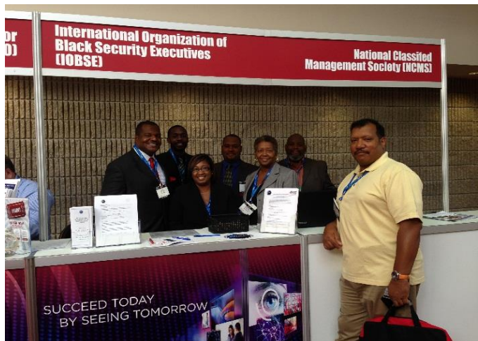
Information booth including IOBSE Board Members and others existing and new members.