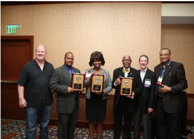
Networking reception including awards and recognition from the ASIS President and from the Association of Industrial Security and Safety Operators of Nigeria.