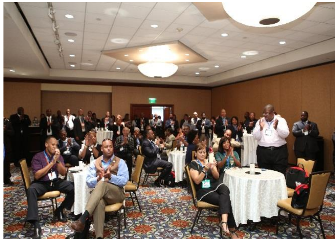
Networking reception including a strategy refresh, organizational update and general member discussion and networking.