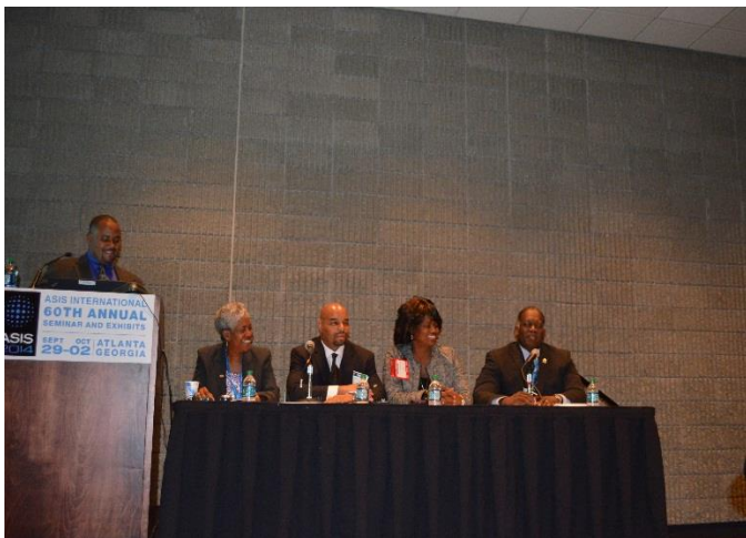
Educational session featuring discussions on leadership, mentoring, professional development and business acumen.